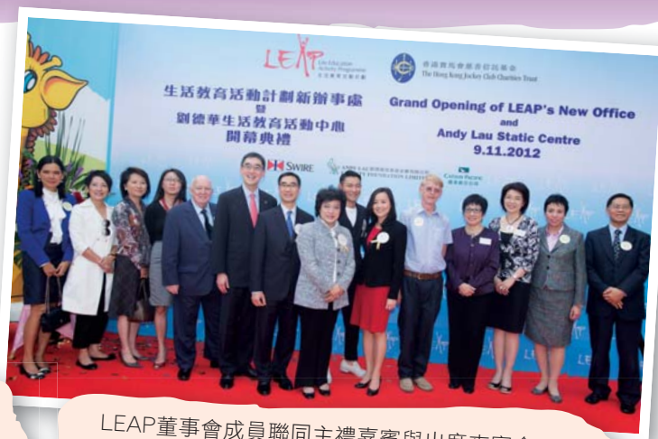
LEAP董事會成員聯同主禮嘉賓與出席來賓合照。 LEAP's Board of Directors with officiating guests and other honourable guests.