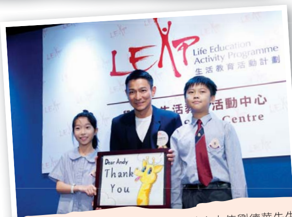
學生代表向生活教育活動計劃健康大使劉德華先生獻上由同學們親手繪畫的感謝卡。 Student representatives presented a hand-drawn thank you card to LEAP's Health Ambassador Mr Andy Lau.