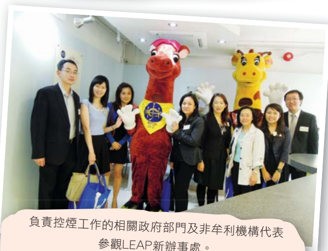
負責控煙工作的相關政府部門及非牟利機構代表參觀LEAP新辦事處。 Government and NGO tobacco control representatives visited LEAP's new office.