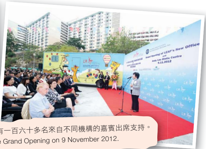
LEAP於去年十一月九日舉行的開幕典禮共有一百六十多名來自不同機構的嘉賓出席支持。 More than 160 guests attended the Grand Opening on 9 November 2012.