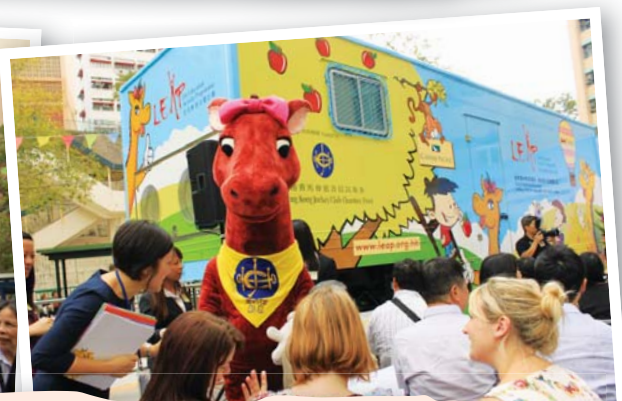
LEAP吉祥物長頸鹿哈樂及小馬凱莉親切地招呼出席來賓及圍觀的鄰近居民。 LEAP's mascots Harold the Giraffe and Holly the Horse greeted our guests and neighbours at the event.