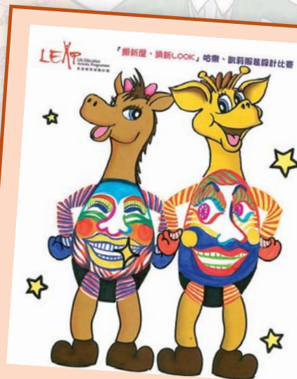
季軍 2 nd Runner-up: 鄧淑穎 Tang Suk Wing