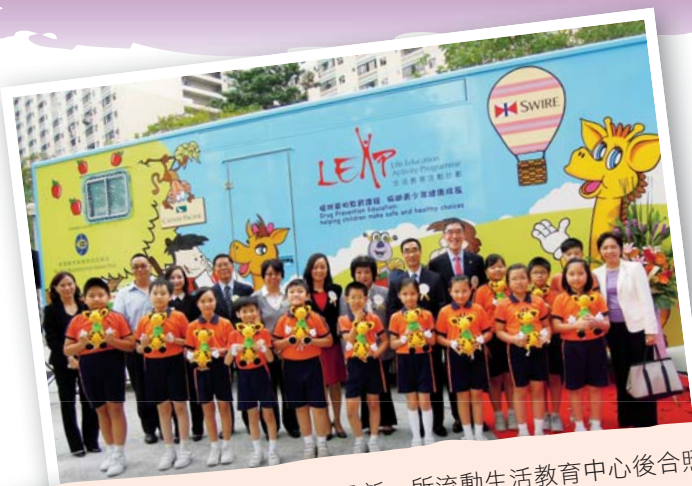
出席嘉賓與學生代表於參觀最新一所流動生活教育中心後合照。 Our honourable guests and student representatives posed in front of the new mobile classroom after visiting a class in action.