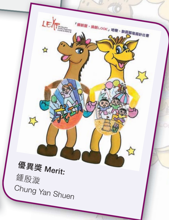
優異獎 Merit: 鍾殷漩 Chung Yan Shuen