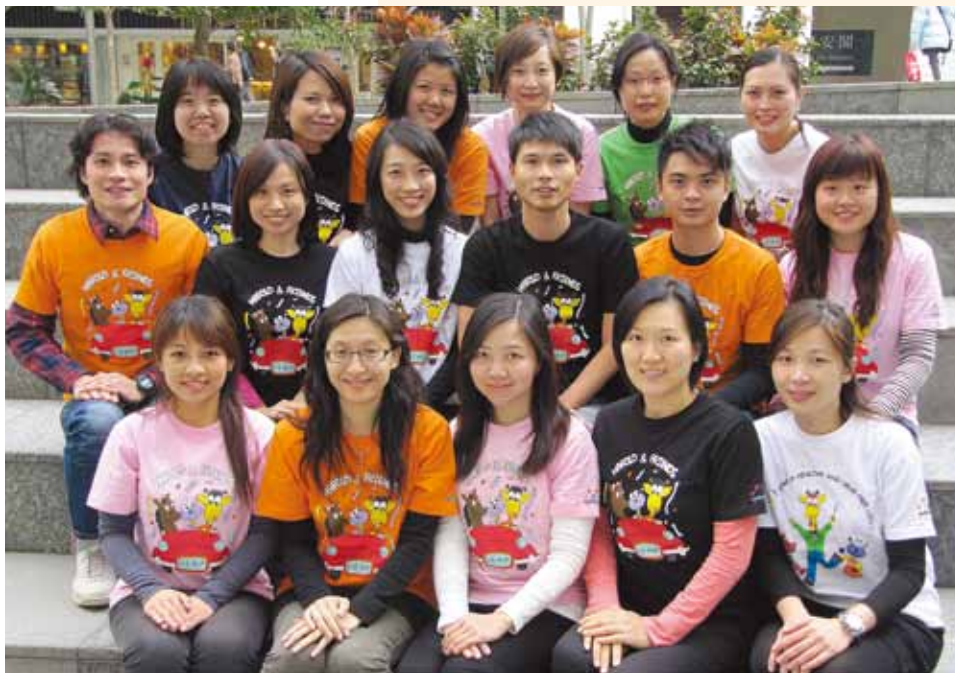
The LEAP team of educators LEAP 全體教育幹事

Life Education originated in Australia. The first Life Education Centre was established in 1979 by the Reverend Ted Noffs in Sydney, Australia. The concept spread throughout Australia and then internationally. Today Life Education operates in Australia, New Zealand, Hong Kong, Macao, Thailand, Indonesia, the UK, Hungary, Finland, Cyprus, Barbados and South Africa.